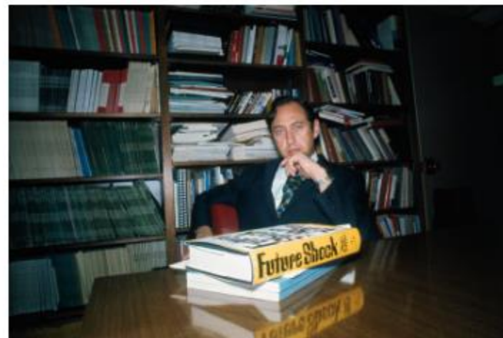
In "Future Shock," Alvin Toffler used the term to describe a real psychological malady stemming from tropic change. Listmania

More than 40 years ago, Alvin Toffler, a writer who had fashioned himself into one of the first futurists, warned that the accelerating pace of technological change would soon make us all sick. He called the sickness "future shock," which he described in his totemic book of the same name, published in 1970.